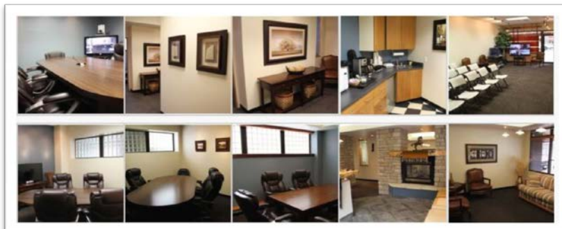
Our Billings office suite features 5 conference rooms and complete amenities.